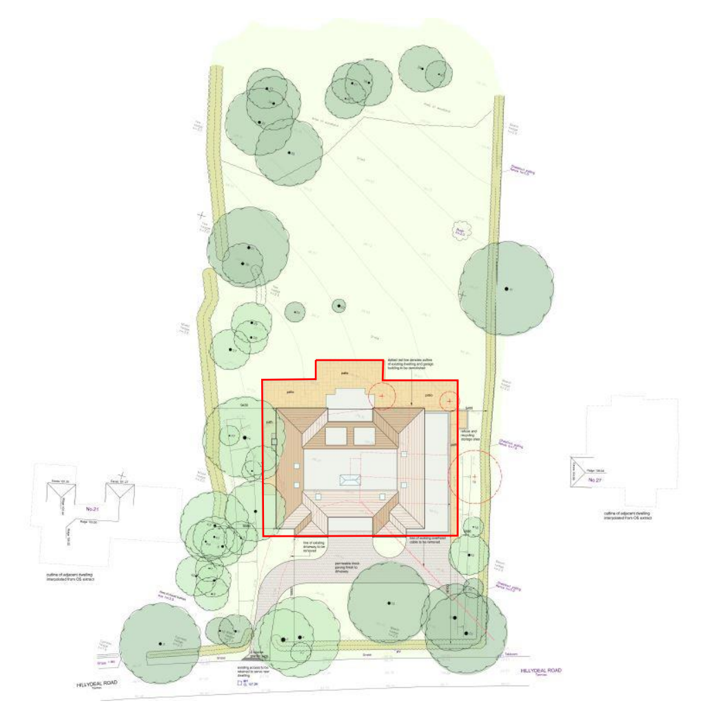
Figure 3. Proposed development and area watched (red line)