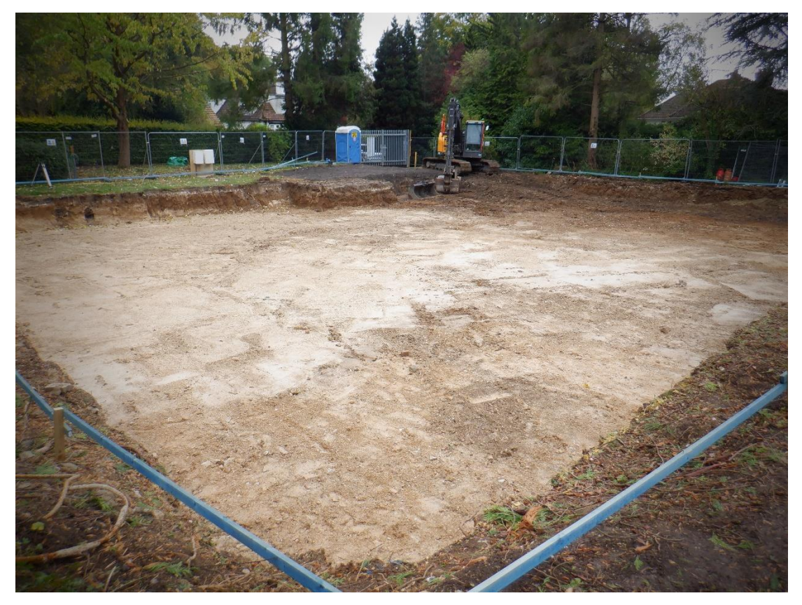
Plate 8. Completed ground reduction (looking South)