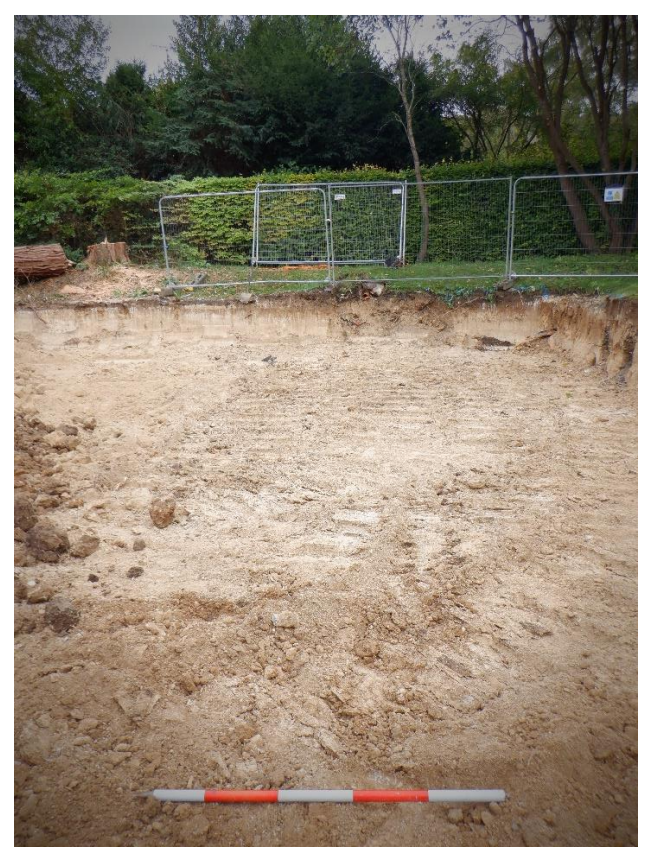
Plate 2. Ground reduction (looking South)