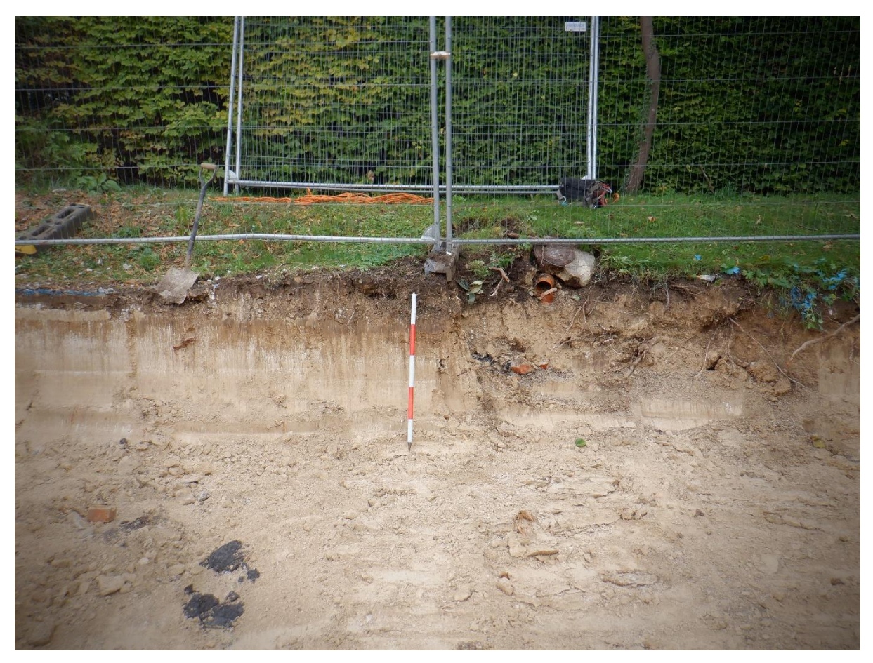
Plate 1. Setting out and starting ground reduction (looking East)