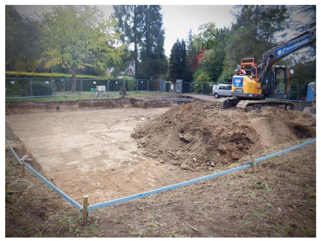
Plate 6. Ground reduction (looking NW)