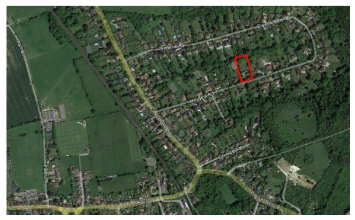
AP 1. Area prior to redevelopment- red line