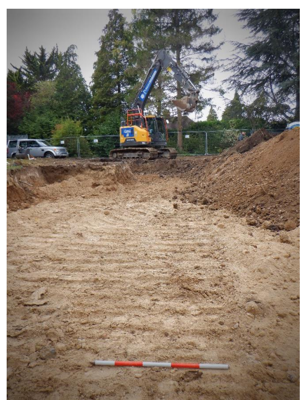
Plate 4. Ground reduction (looking West)