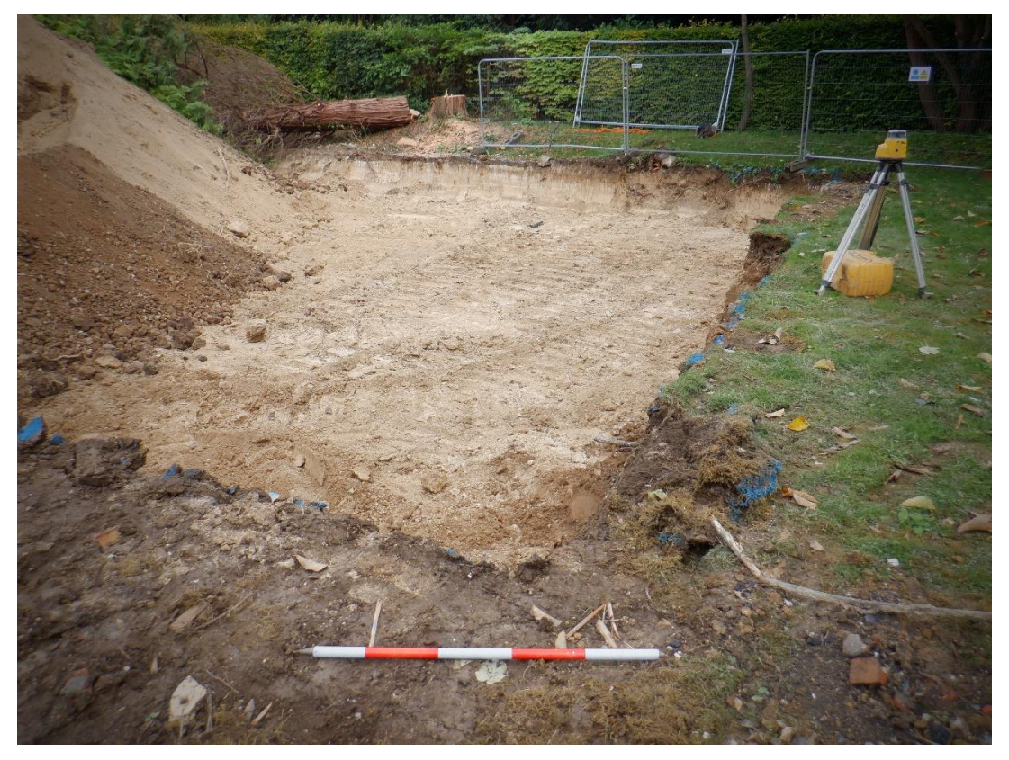
Plate 5. Ground reduction (looking NE)