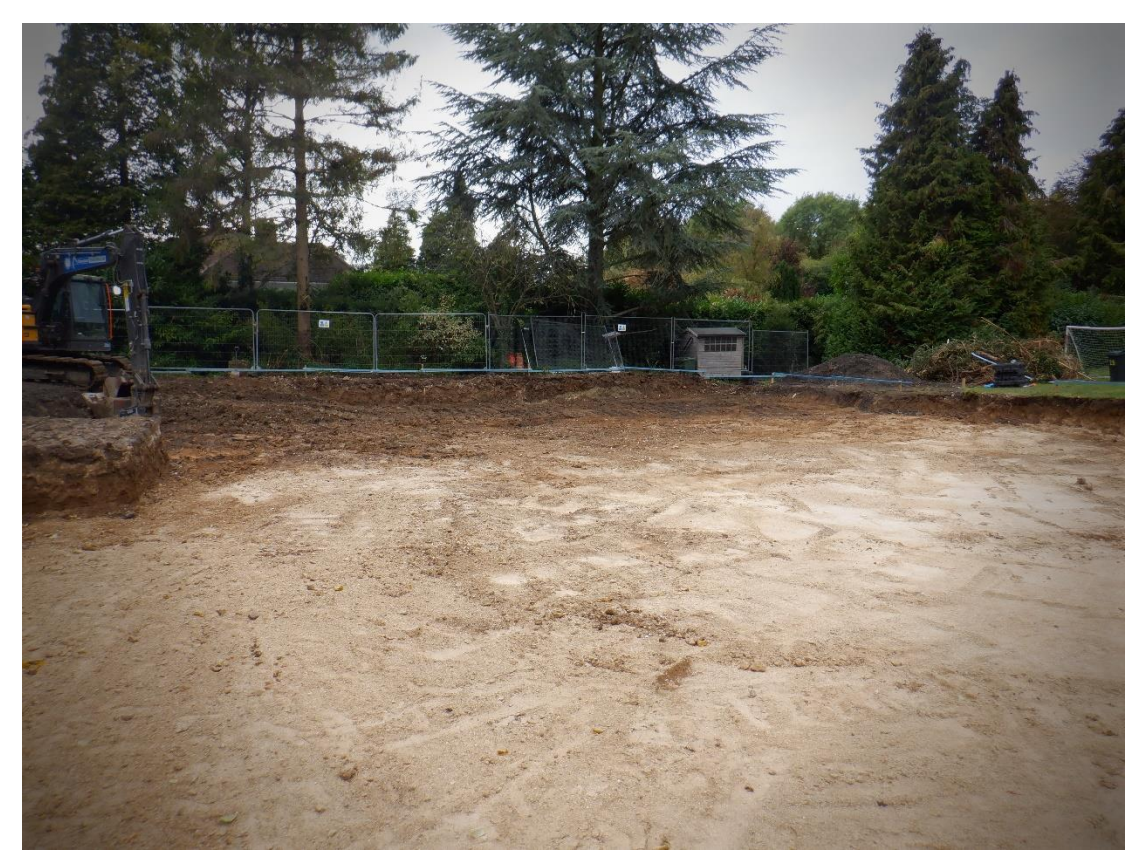
Plate 7. Completed ground reduction (looking East)