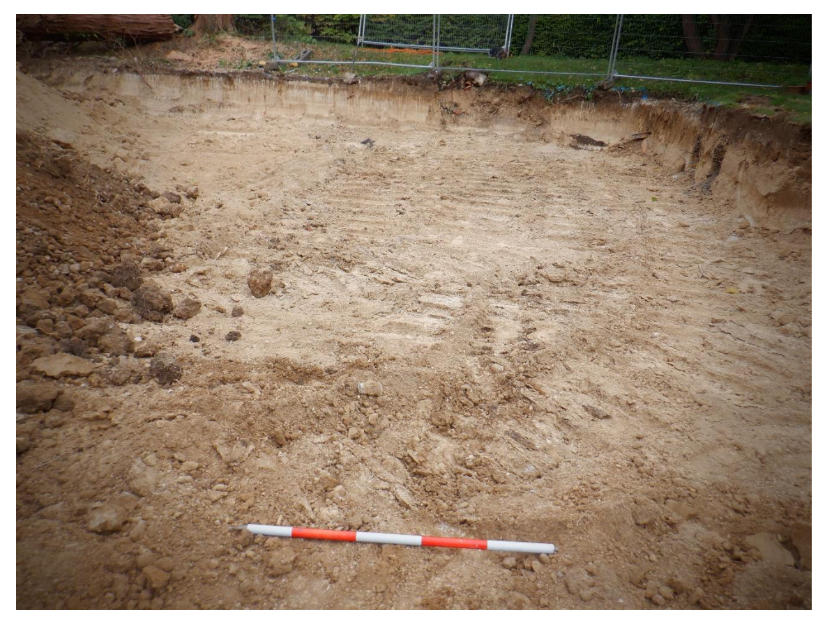
Plate 3. Ground reduction (looking East)